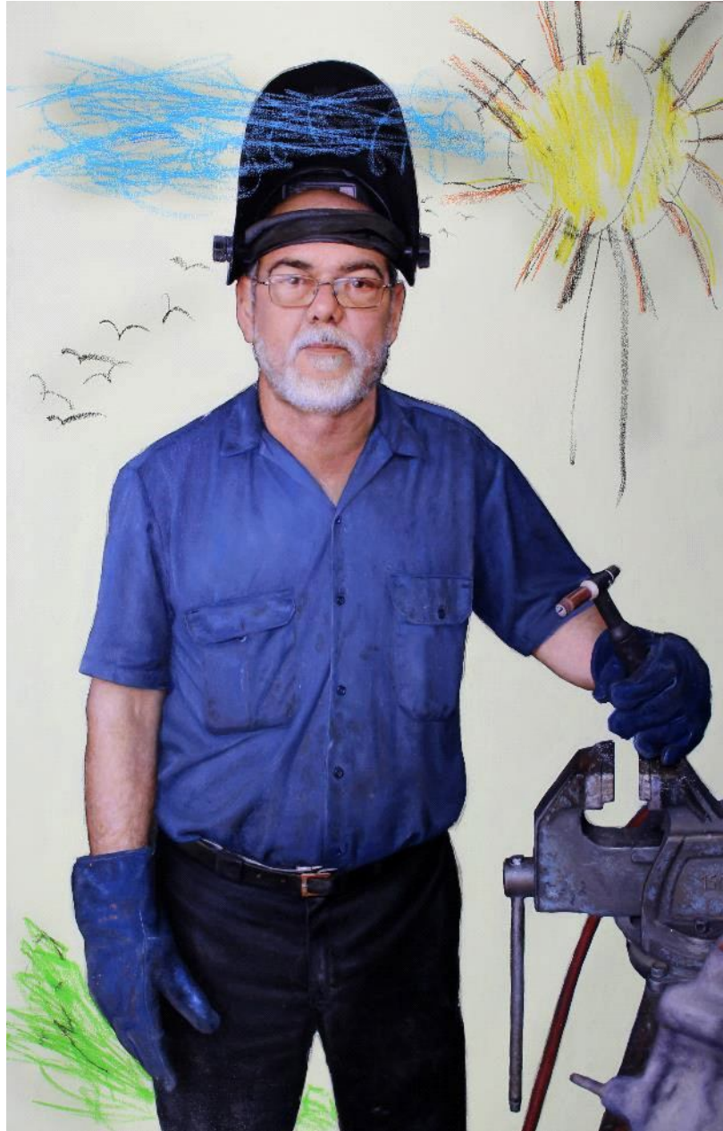
Armed, 2015. Oil and crayons on linen, 63 x 40 in.