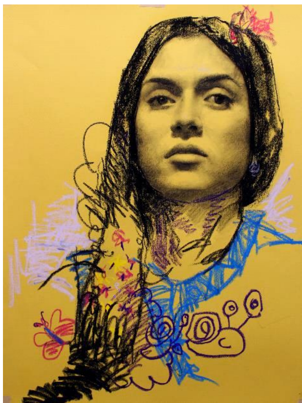
Snail, 2015. Charcoal and crayon on paper, 25 x 19 in.